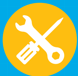
DISASSEMBLY & REASSEMBLY