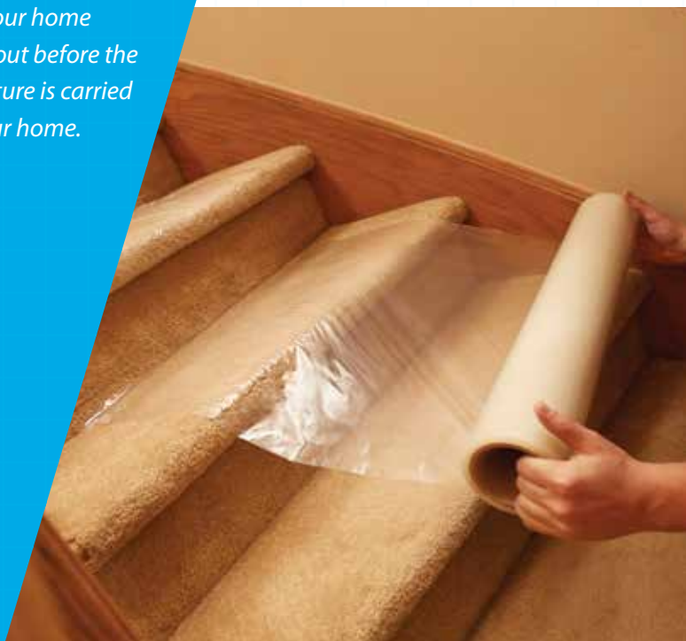
Carpet guard on your stairways ensures they stay looking good as new.

On every Corrigan move, we utilize a variety of home protection measures to ensure that we protect your floors, doors and banisters. At both origin and destination, our home protection is laid out before the first piece of furniture is carried out of, or into, your home.