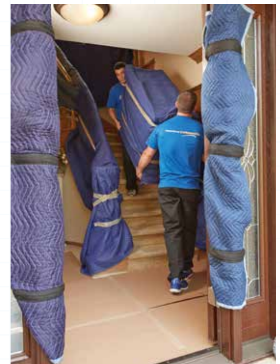
Door jam covers ensure entryways are protected from start to finish.