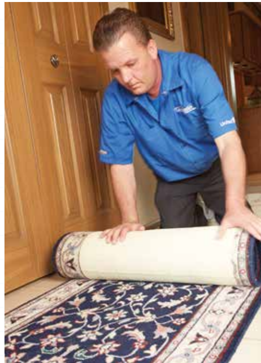
We remove your valuable rugs prior to applying floor coverings.