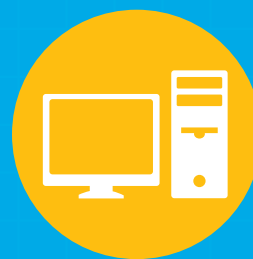
PERSONAL COMPUTER SETUP