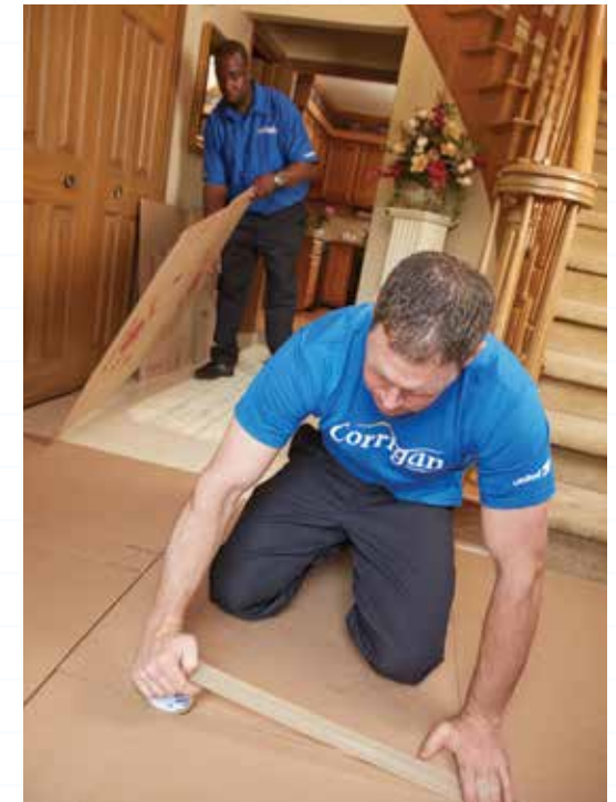
We use heavy duty cardboard to leave tile and wood flooring unmarked.